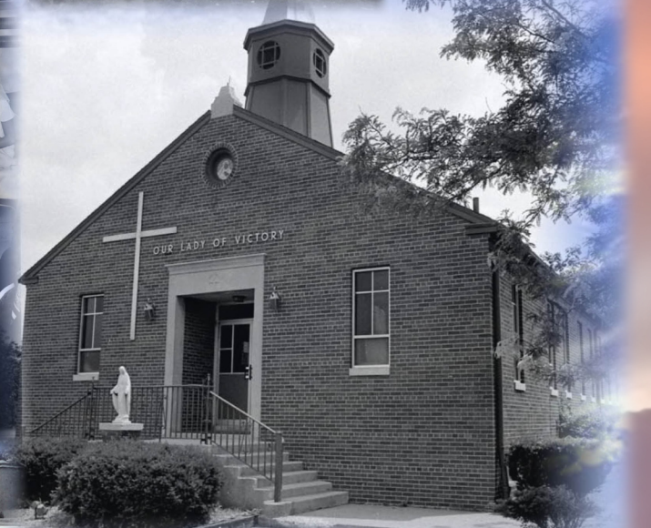
1964 - OUR LADY OF VICTORY SCHOOL - 1965 Detroit, Michigan